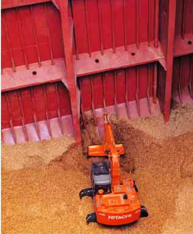
● Increased durability and productivity with Swedish-steel bucket