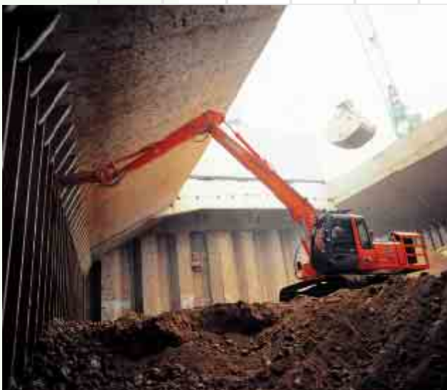
● The air-jetting device on the arm top makes shelf breaking work easy and ensures increased safety.