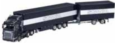
SCANIA R 500 4x2 Highline tractor with refrigerator trailer and short middle axle trailer. Scale 1:50.