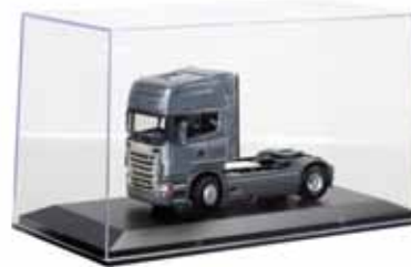
SCANIA R 620 4x2 Topline in exclusive box. Scale 1:50.