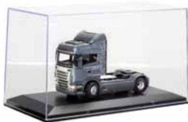
SCANIA R 620 4x2 Highline in exclusive box. Scale 1:50.