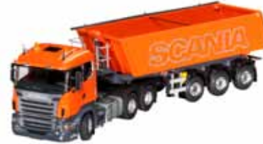
SCANIA R 560 6x4 Tractor with 3-axle tipper trailer. Scale 1:50.