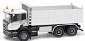
SCANIA P 380 6x4 Tipper. Scale 1:87.