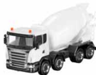
SCANIA R 380 8x4 Concrete Mixer. Scale 1:87.