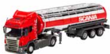
SCANIA R 480 4x2 Highline stainless steel tank semi-trailer. Scale 1:87.