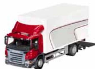
SCANIA P 230 4x2 Distribution truck with tail gate lift. Scale 1:25.