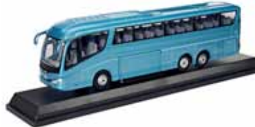
SCANIA IRIZAR PB Scale 1:50.