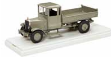
VINTAGE TRUCK "Fryken" 1928. Scale 1:50.