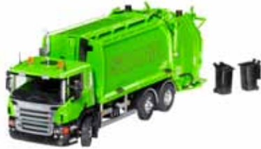
SCANIA P 310 6x2 Refuse collector truck. Scale 1:50.