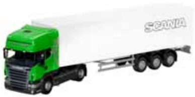
SCANIA R 620 4x2 Topline with box semi-trailer. Scale 1:25.