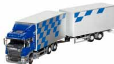
SCANIA R 500 6x2 Highline truck with trailer. Scale 1:50.