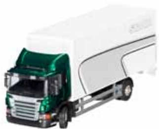
SCANIA P 280 4x2 Distribution truck with tail gate lift. Scale 1:50.