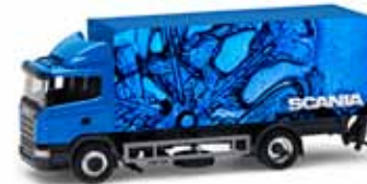
SCANIA R 230 Distribution truck 4x2. Scale 1:87.