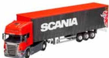
SCANIA R 420 4x2 Topline curtain side semi-trailer. Scale 1:50.