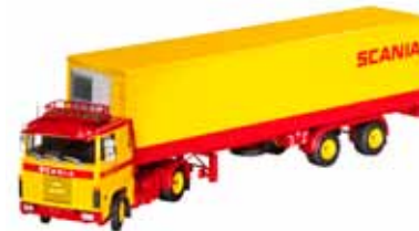
SCANIA LBI40 SUPER 4x2 Tractor with old style reefer trailer. Scale 1:50.