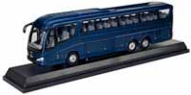
SCANIA IRIZAR PB Scale 1:50.