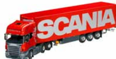
SCANIA R 500 6x2 Topline tractor, with 3-axle refrigerator trailer. Scale 1:50.