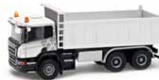
SCANIA P 380 6x4 Tipper. Scale 1:50.