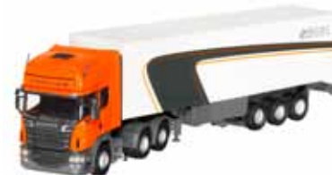
SCANIA R 560 6x2 Topline tractor with refrigerator trailer. Scale 1:87.