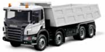
SCANIA P 380 8x4 Tipper. Scale 1:50.