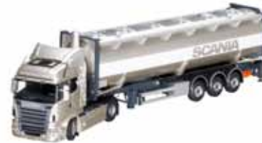
SCANIA R 420 4x2 Highline with tipping silo container trailer. Scale 1:50.