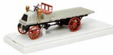
VINTAGE TRUCK Vabis 1902. Scale 1:50.