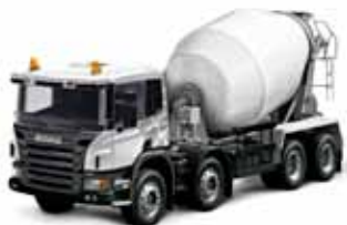
SCANIA P 380 8x4 Concrete mixer. Scale 1:50.