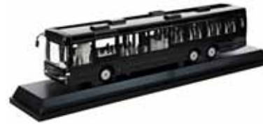
OMNILINK Scale 1:50.