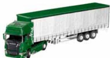
SCANIA R 730 4x2 Topline tractor with curtain side semi-trailer. Scale 1:50.