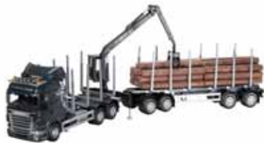
SCANIA R 620 6x4 Highline timber truck with trailer. Scale 1:25.