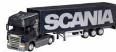
SCANIA R 620 4x2 Topline tractor with semi-trailer. Scale 1:24.