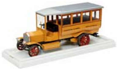
VINTAGE BUS 1911. Scale 1:50.