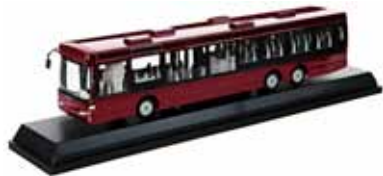
OMNILINK Scale 1:50.