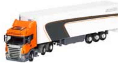
SCANIA R 560 6x2 Highline reefer semi-trailer. Scale 1:50.