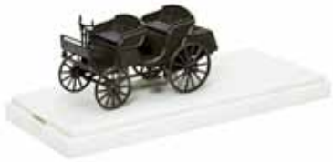
VINTAGE "Eriksson roadster" 1897. Scale 1:50.