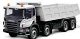
SCANIA P 380 8x4 Tipper. Scale 1:87.