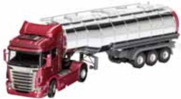
SCANIA R 480 4x2 Highline Stainless steel tank semi- trailer. Scale 1:50.