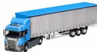
SCANIA R 440 4x2 Highline curtain side semi-trailer. Scale 1:50.