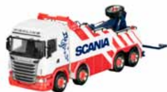
SCANIA R 480 8x4 Highline recovery vehicle. Scale 1:87.