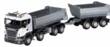
SCANIA R 480 8x4 Tipper with trailer. Scale 1:25.