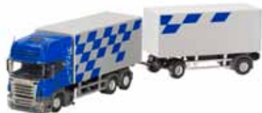
SCANIA R 420 6x2 Topline truck with trailer. Scale 1:87.