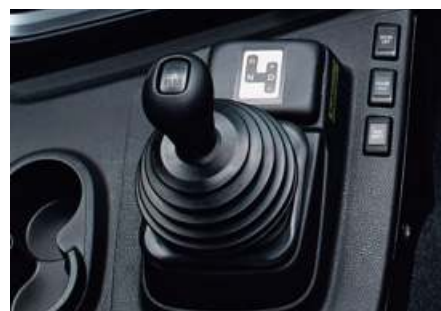
AMT model shown