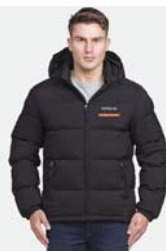
HITACHI PUFFER JACKET