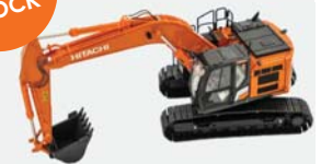
MODEL - ZX345USLC-7H