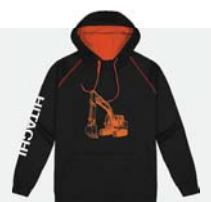
HITACHI KIDS HOODIE