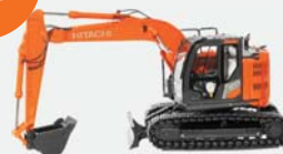
MODEL - ZX135US-7