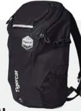
BACKPACK, TRADITIONAL, 18L, TIGERCAT BRAND