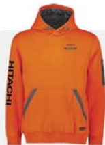
HITACHI WATER RESISTANT HOODIE