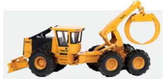
MODEL, DIE-CAST, 635D SKIDDER