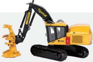
MODEL DIE-CAST 870C