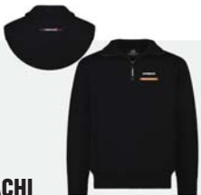
HITACHI WINDSTOPPER LINED JERSEY