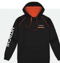
HITACHI PERFORMANCE HOODIE