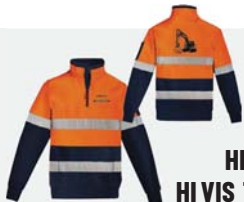
HITACHI HI VIS TAPED HALF ZIP PULLOVER